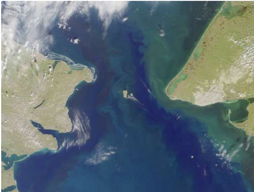
The Diomed Islands, Big and Little, in the Bering Strait.