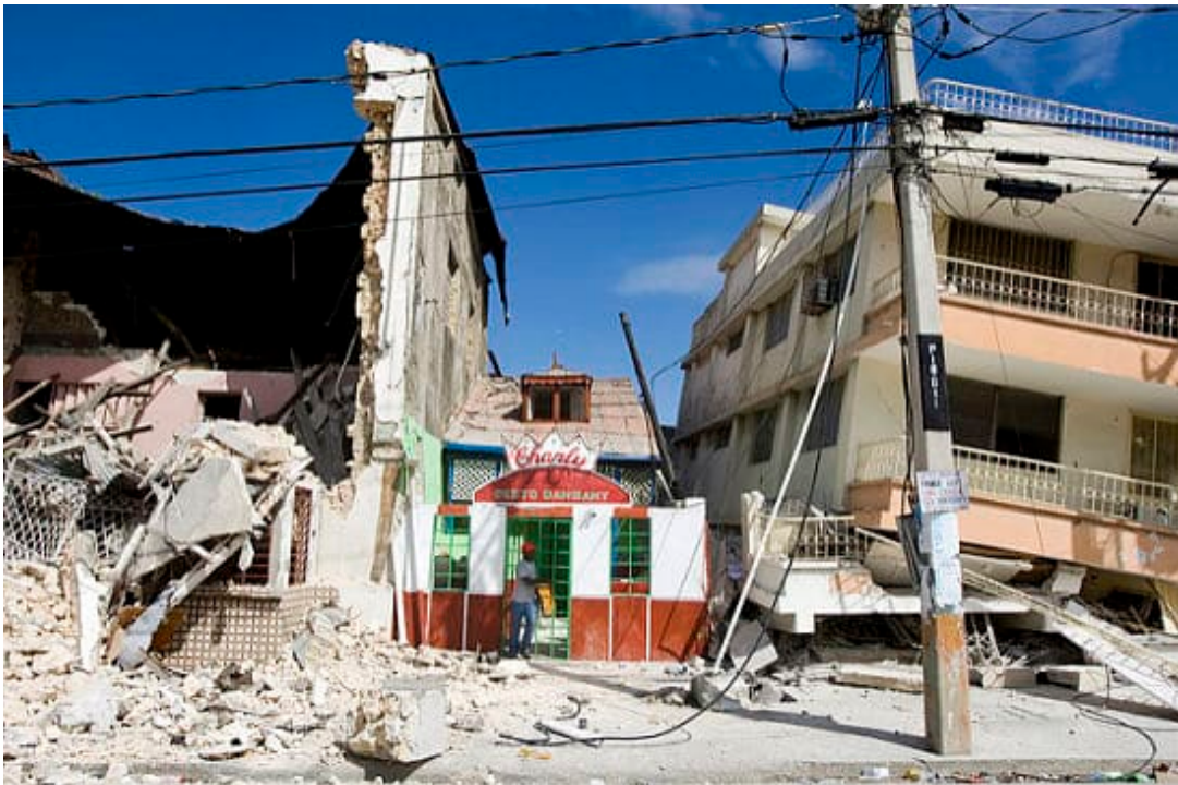
“A man in Port-au-Prince exits a restaurant after he looked for his belongings.”

politics. Building on arguments about philanthropic imperialism, notably by Alex de Waal, they complicate understandings of humanitarianism's ideological underpinnings through examples from Libya, Palestine, Uganda and the 2010 Haitian earthquake - where political and relief interventions incredibly caused more devastation than the disaster itself.