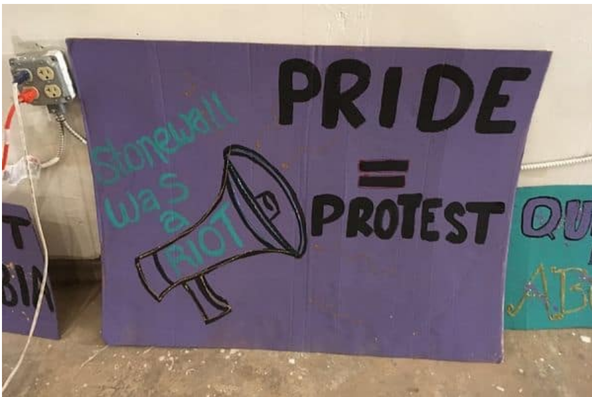
Item #1: "Pride = Protest" sign. Washington, DC.

Items already uploaded to the Protest Matters! Virtual Museum include the following, shared with Allegra Lab readers — who are invited to contribute their own objects to the collection: