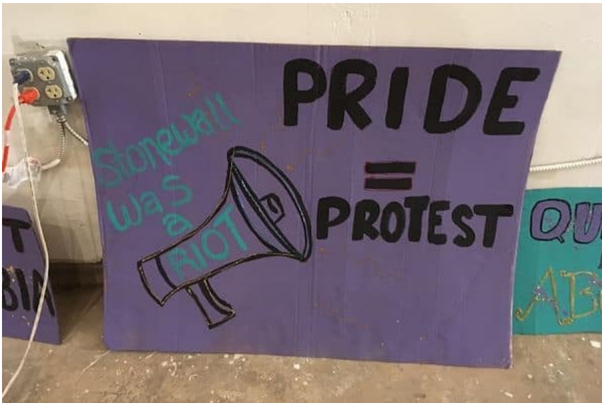
Item #1: "Pride = Protest" sign. Washington, DC.

Items already uploaded to the Protest Matters! Virtual Museum include the following, shared with Allegra Lab readers — who are invited to contribute their own objects to the collection: