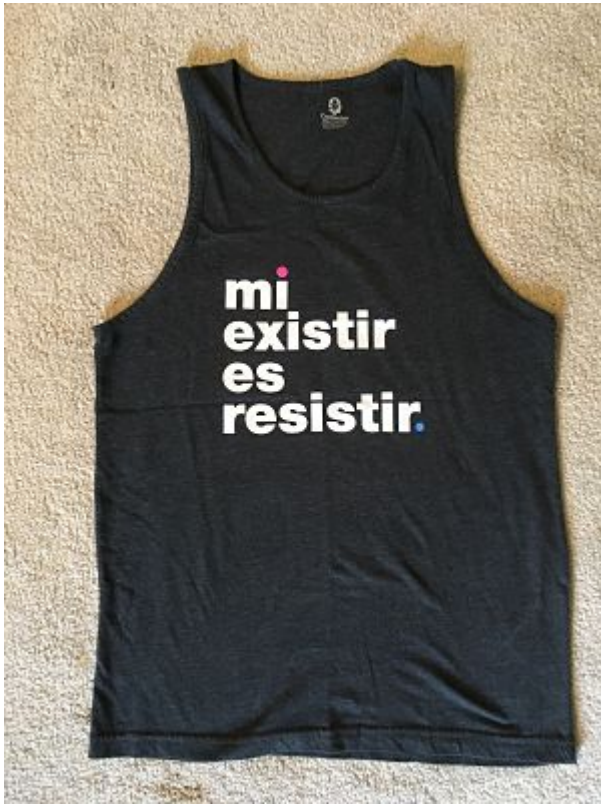
Item #4: "mi existir es resistir" tee. Washington, DC.